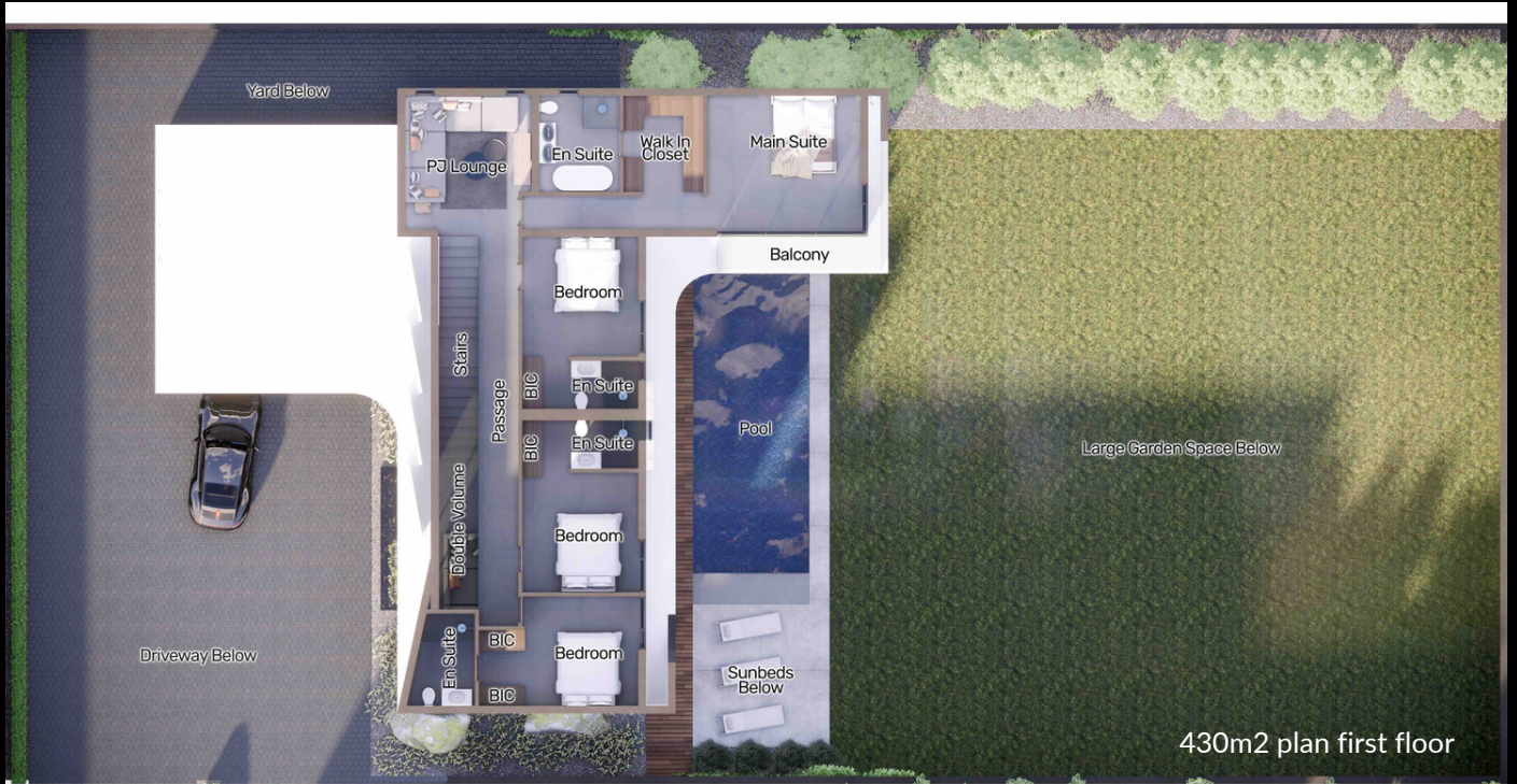
430m2 plan first floor

Client: House CUL, Project: ERF 919, Bryanston Illustration: First Floor Orthographic View Date: 2023/09